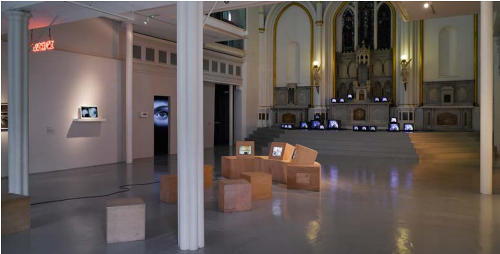
Modern Experiments, Highlanes Gallery, Drogheda, 2017